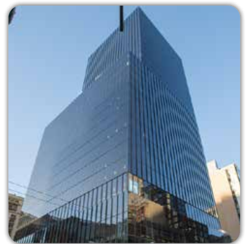
LinkedIn Building in San Francisco

Around the same time PayPal was acquired in 2002 by Pierre Omidyar's rising online giant, eBay, Hoffman launched his own e-company (with capital from Thiel and venture capital firm Greylock Partners): San Francisco-based LinkedIn, today the top social networking site for professionals with some 774 million members across 200 countries. But it was LinkedIn's 2011 IPO that made Hoffman a billionaire (net worth: $2.2 billion as of writing); five years later, Microsoft purchased the company for $26.2 billion and added Hoffman to its board of directors.