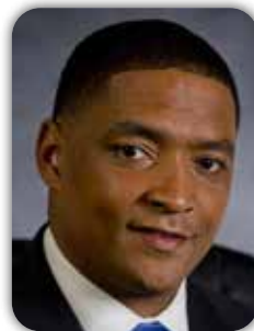
Cedric L. Richmond