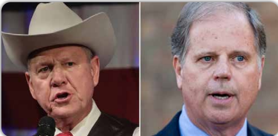
Roy Moore and Doug Jones