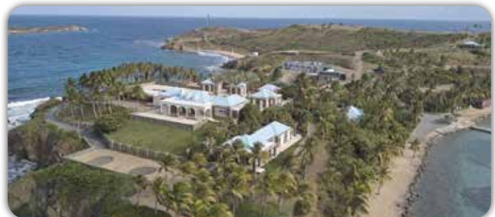
Hoffman visited Epstein’s “pedophile island,” Little St. James

When the scandal broke four years later, Thiel and Musk distanced themselves from Epstein; Hoffman reportedly did not.